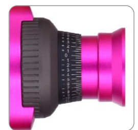
Wide diopter range High precision adjustment