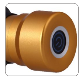
Touch switch Auto power-off